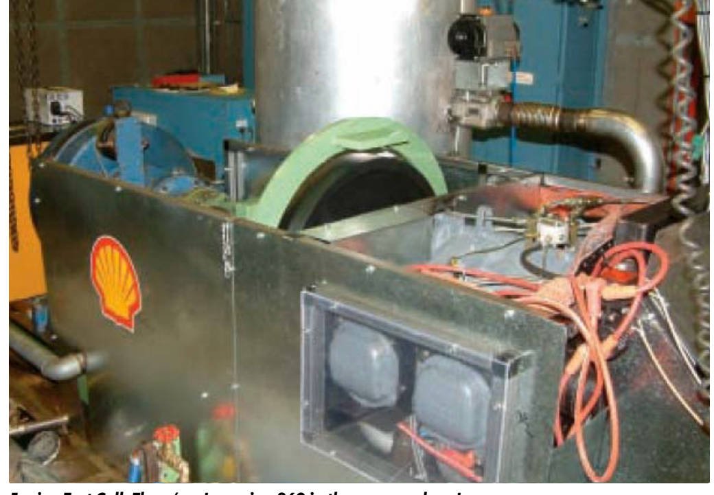
Engine Test Cell: There's a Lycoming 360 in there somewhere!

There is one more fundamental difference where Avgas outperforms Mogas – that of octane rating. Octane is the measurement of a fuel's detonation resistance. All fuels will automatically combust before the flame reaches them if the temperatures and pressures are high enough in the yet-unburned gas. This leads to explosive combustion of the remaining fuel in a phenomenon known as detonation. Severe detonation can destroy an engine in a few seconds. Octane rating measures