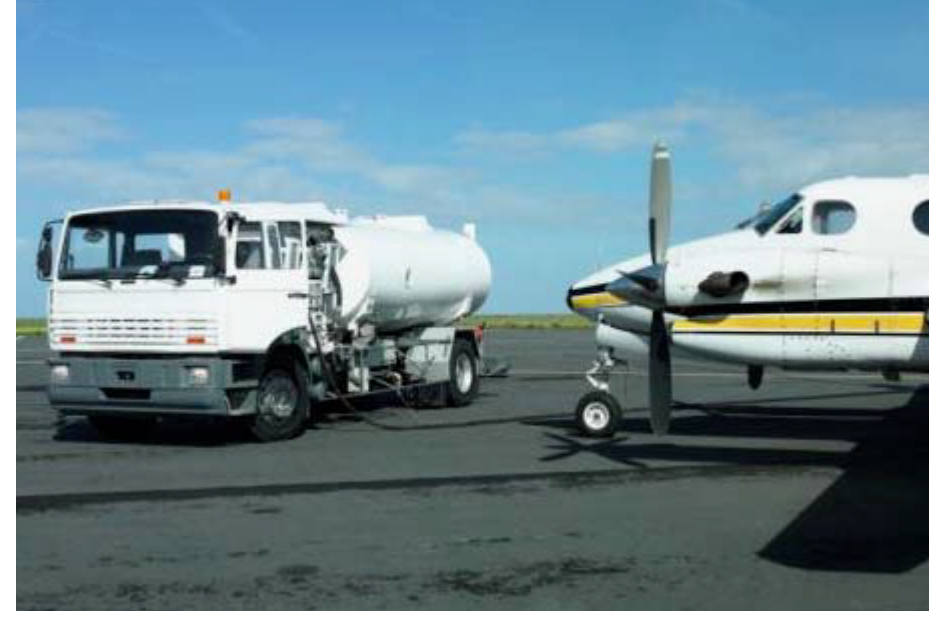
"Refueling with Mogas - it's not just the process that is less controlled, so is the product".

• Less regulation of which constituents are allowed when making the fuel;